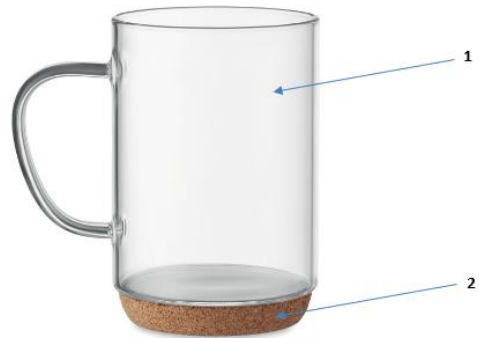
1: direct food contact