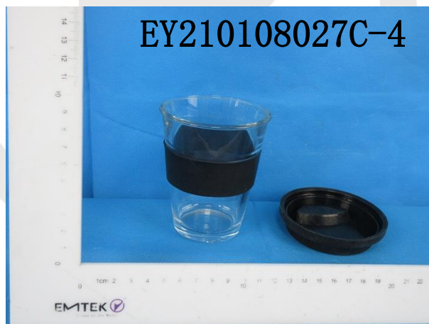
Microwave after testing