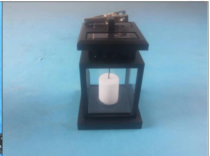
Before the test