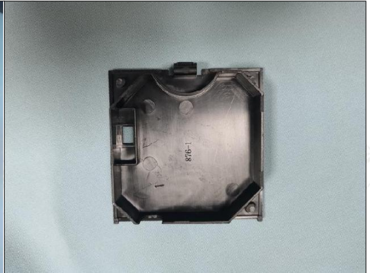
Disassembly and inspection after test 1