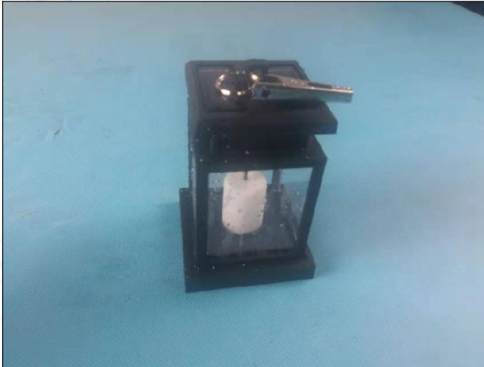
After the test