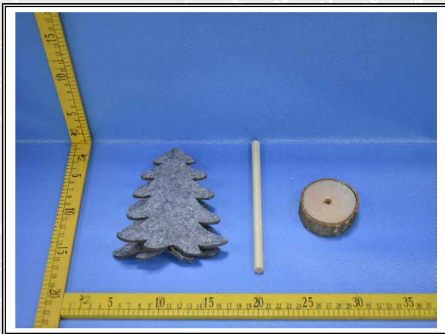
Photograph of parts tested: