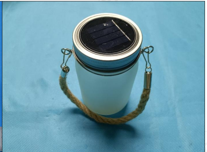
Before the test

This report is issued by the company in accordance with the requirements of the "Conditions of Issuance of Test Reports" printed in the attached page. Unless otherwise stated, the results presented in this report only apply to the samples tested this time. Partial reproduction of this report is not allowed unless approved by the company in writing.