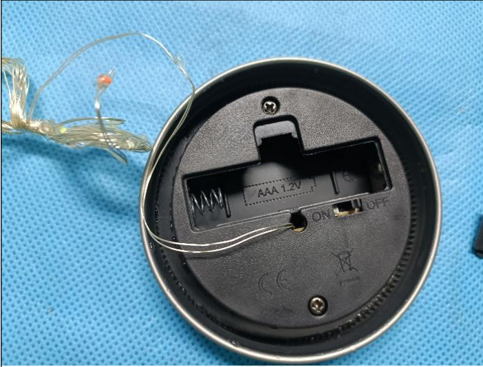
Sample after test