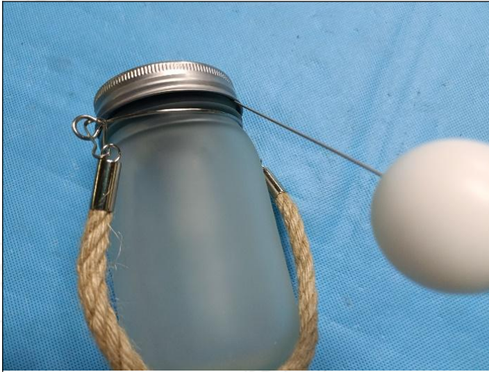
Sample during test IP4X