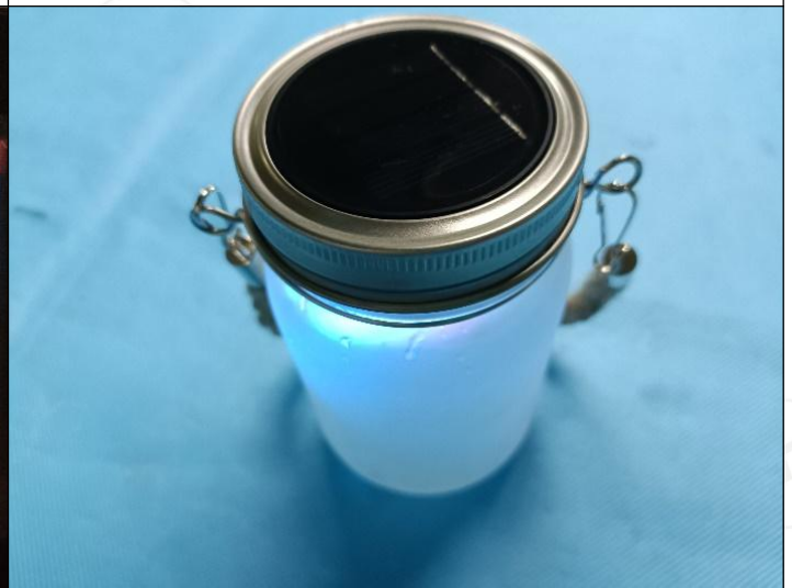
Sample after test

This report is issued by the company in accordance with the requirements of the "Conditions of Issuance of Test Reports" printed in the attached page. Unless otherwise stated, the results presented in this report only apply to the samples tested this time. Partial reproduction of this report is not allowed unless approved by the company in writing.