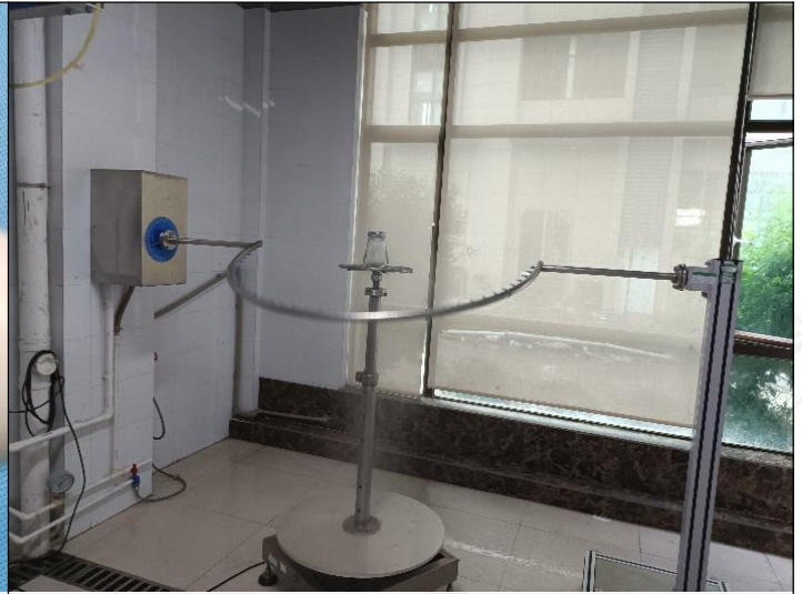
Sample during test IPX4